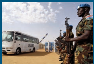
Advising Peace Operations

Founded in 1970 as the International Peace Academy, the organization was first devoted to the training of military and civilian professionals in peacekeeping. In 2008, the organization changed its name to the International Peace Institute to reflect its current identity as a research institution that works with and supports multilateral institutions, governments, civil society, and the private sector on a range of regional and global security challenges.