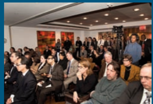
Presenting Public Discussion

“Uniquely positioned and widely respected, the International Peace Institute (IPI) has long been a trusted partner of the United Nations in thinking through how to tackle a challenging and changing security agenda. Through its policy, research, expert advice and convening capacity, IPI regularly contributes to strengthening the UN’s efforts to build a more peaceful, just and sustainable world.”