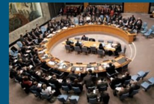
Informing Decision Making