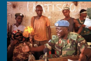
Assisting Conflict Prevention

To achieve its purpose, IPI employs a mix of risk analysis, policy research, publishing, and convening. It carries out work in and on Africa, the Middle East, Europe, and Central Asia. IPI provides practical policy insight and advice for international and national policymakers, as well as for the broader foreign affairs community. Among the primary consumers of its policy research and analysis are the UN and its 193 member states, regional and subregional organizations, academia, and civil society. With its Trygve Lie Center for Peace, Security & Development affording IPI unique convening capacity, the institute conducts much of its work in meetings of diplomats, government officials, and experts from the UN community and world capitals, along with IPI researchers. This establishes a trustful atmosphere for searching, unbiased discussion and debate, and provides a forum for finding common ground among parties engaged in negotiation in otherwise politicized environments. IPI’s policy recommendations are consequently highly valued for their candor and credibility.