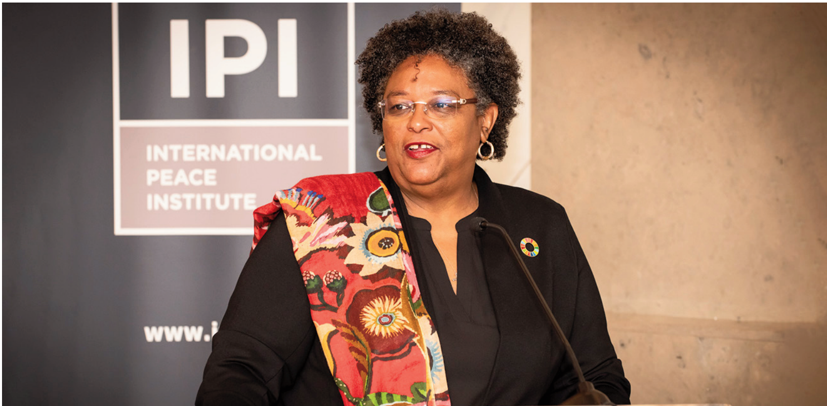
Prime Minister of Barbados Mia Amor Mottley