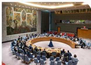
Women, Peace and Security at 25