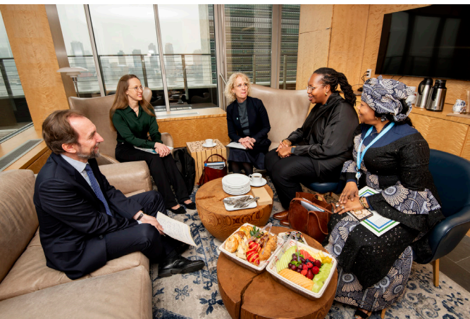
"Shattering Glass: The United Nations Security Council, its Elected Ten, and Women, Peace and Security," March 6