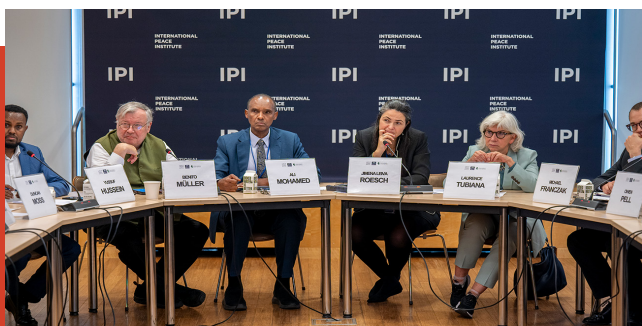
"2024: The Turning Point for Innovative Financing and Solidarity Levies?" September 27

To support climate finance, IPI is working with the International Taxation Task Force to develop economically and politically viable proposals for new taxes whose proceeds would be directed toward climate action. IPI published multiple reports on the topic in 2024, including on the political economy of current tax discussions and legal precedents and pathways for climate solidarity levies through ports in New York/New Jersey and Los Angeles. During high-level week, IPI also convened a roundtable with three leading advocates for climate solidarity levies, and momentum from the event inspired the creation of an official side event at COP29 to encourage first movers and widespread adoption.