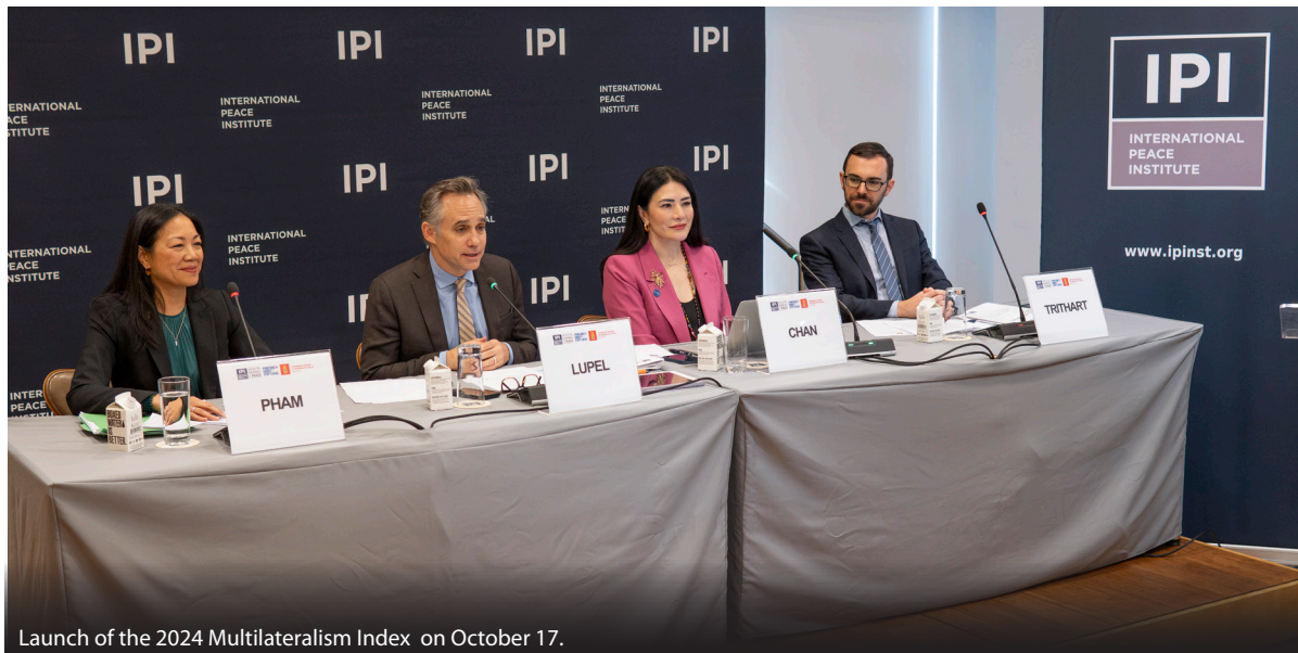
Launch of the 2024 Multilateralism Index on October 17.

This fall, IPI and the Institute for Economics and Peace launched the second edition of the Multilateralism Index. The Index measures the health of the multilateral system based on 45 indicators across the domains of peace and security, human rights, climate action, public health, and trade. Overall, data from the Index show that while participation in the multilateral system remains robust, performance has deteriorated across all five domains. The Index has helped stimulate conversation within the UN community, and IPI presented the findings to the German foreign ministry, at a launch event in New York, and during a visit to Singapore this November. Within the first two months of publication, the report was downloaded more than 37,000 times, and social media posts reached over 1 million people.