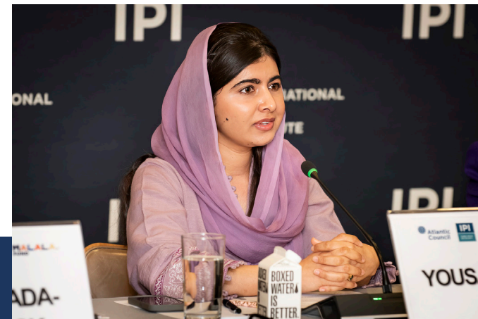
Malala Yousafzai, Nobel Peace Laureate on the panel "A High-Level Panel Discussion on Gender Apartheid in Afghanistan," March 8