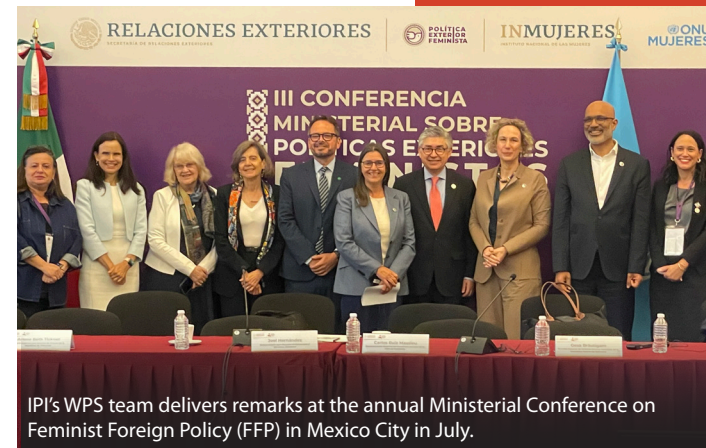
IPI's WPS team delivers remarks at the annual Ministerial Conference on Feminist Foreign Policy (FFP) in Mexico City in July.