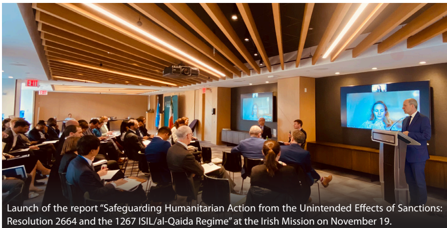
Launch of the report "Safeguarding Humanitarian Action from the Unintended Effects of Sanctions: Resolution 2664 and the 1267 ISIL/al-Qaida Regime" at the Irish Mission on November 19.

Throughout 2024, IPI convened several multistakeholder roundtables to facilitate in-depth exchange on the implementation of the resolution, build trust among policymakers, and gather evidence on the resolution's impact. The findings from these roundtables were captured in an issue brief, which IPI published in November, and which was launched at the Permanent Mission of Ireland to the UN. To follow up on this work, IPI is continuing to engage with member states to ensure the sustainability of the resolution and its positive impact on the delivery of humanitarian aid.