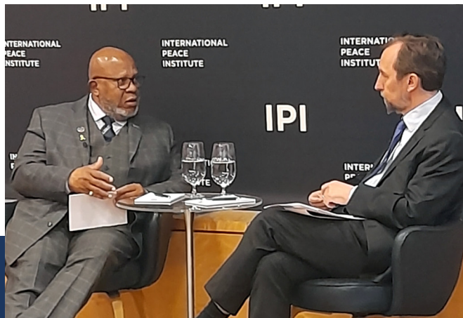
"Global Leaders Series Featuring President of the UN General Assembly Dennis Francis," April 24