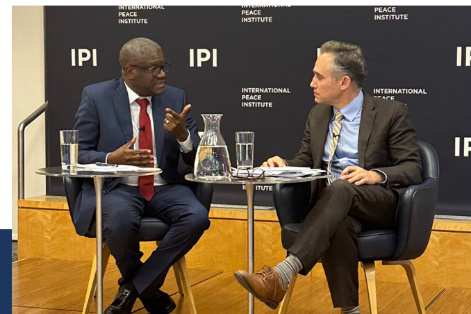
"Global Leaders Series featuring Nobel Peace Prize Laureate Dr. Denis Mukwege," November 13