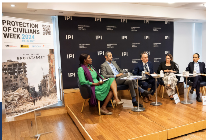
"25 Years of POC and the UN Security Council: Challenges and Opportunities," May 20