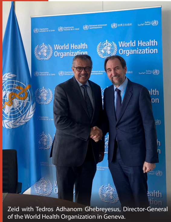
Zeid with Tedros Adhanom Ghebreyesus, Director-General of the World Health Organization in Geneva.