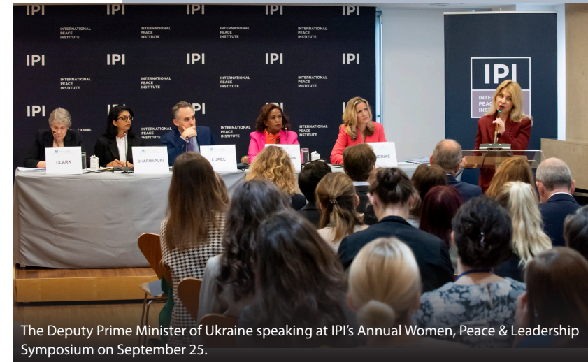
The Deputy Prime Minister of Ukraine speaking at IPI's Annual Women, Peace & Leadership Symposium on September 25.

Member states also convened in September for the much-anticipated Summit of the Future, which aimed to create a "once-in-a-generation opportunity to enhance cooperation on critical challenges." During the summit, and following nearly two years of negotiations, member states unanimously adopted the Pact for the Future, representing an important success for multilateralism. IPI supported member-state negotiations on the pact across multiple issue areas, including sustainable development, peace and security, and transforming global governance, in particular by supporting the coordination of small states' positions in partnership with Singapore. Following the adoption of the pact, IPI has been engaging with stakeholders to support implementation of its 56 action areas.