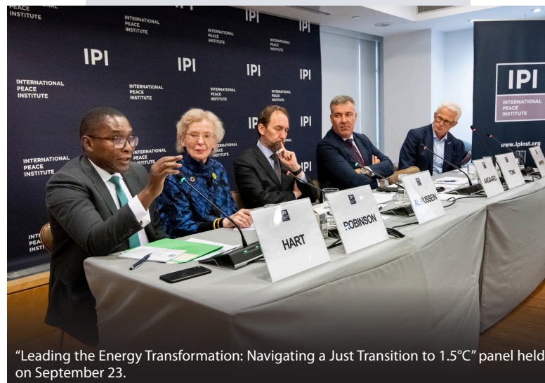
"Leading the Energy Transformation: Navigating a Just Transition to 1.5°C" panel held on September 23.