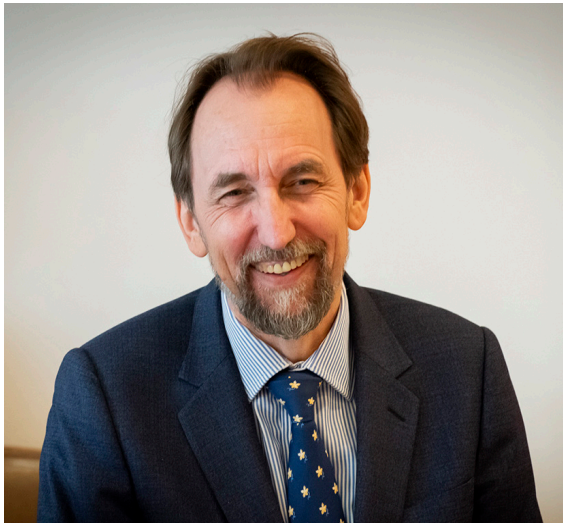
- Zeid Ra'ad Al Hussein

IPI is ideally situated to harness that desire to make multilateral cooperation more effective. We are grateful for your partnership in that endeavor—especially the meaningful engagement of individual members of the IPI Board of Directors during this year’s General Assembly in September. We are keen to further grow your engagement in our activities and operations in the year ahead.