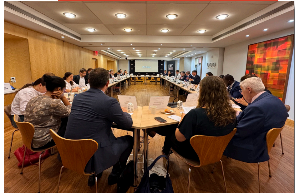
"Maintaining the Momentum on UN Security Council Resolution 2664 and Its Humanitarian Carve-out for the UN ISIL and al-Qaida Sanctions Regime," June 6

Through its research and convening on human rights and humanitarian affairs, IPI seeks to bridge debates in Geneva and New York, with a focus on safeguarding humanitarian action at a time when principled aid and rights-based approaches are under increasing stress.