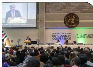
Summit of the Future