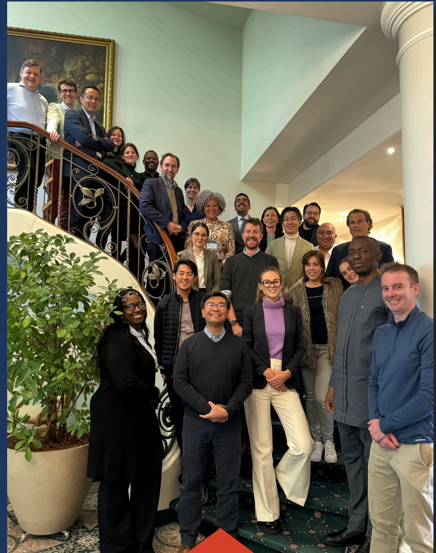
Informal gathering of the Spirit of Mont-Pèlerin Group on the margins of INB negotiations on a new agreement on pandemic prevention, preparedness, and response taking place in Geneva in April 2024.

IPI's efforts to revitalize international cooperation have centered on fostering a more inclusive system. In addition to continuing its work to bolster the roles of small- and medium-sized states, IPI began a new project to garner African perspectives on the emerging global order. IPI also continued supporting negotiations for a global pandemic treaty, peaceful solutions to the conflict in the Middle East, and respect for international humanitarian law.