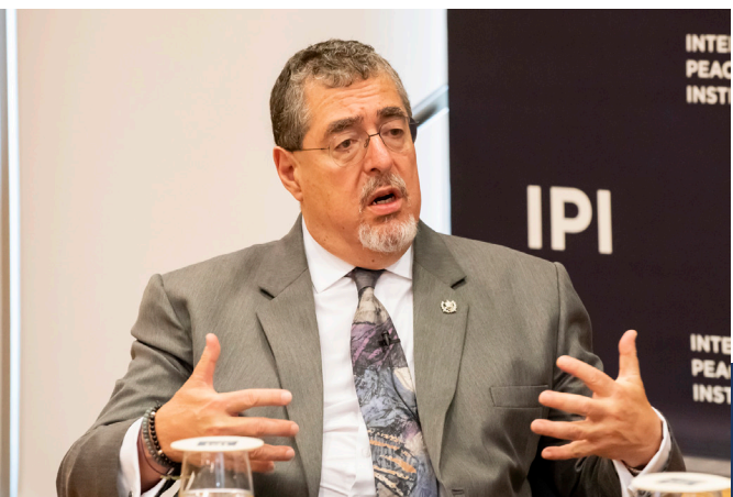
"Global Leaders Series Featuring President of Guatemala Bernardo Arévalo," June 4