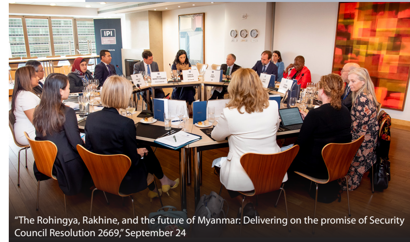
"The Rohingya, Rakhine, and the future of Myanmar: Delivering on the promise of Security Council Resolution 2669," September 24