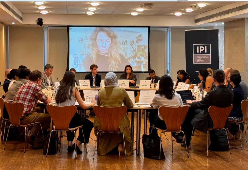
"Expert Consultation: Options for the Protection of Civilians in Sudan," August 13